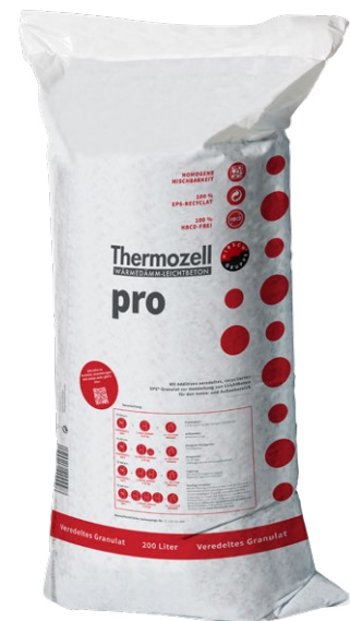
pro Refined Granule