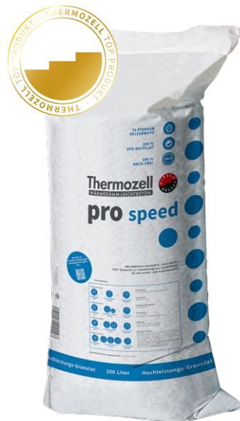
pro speed Refined High Performance Granule